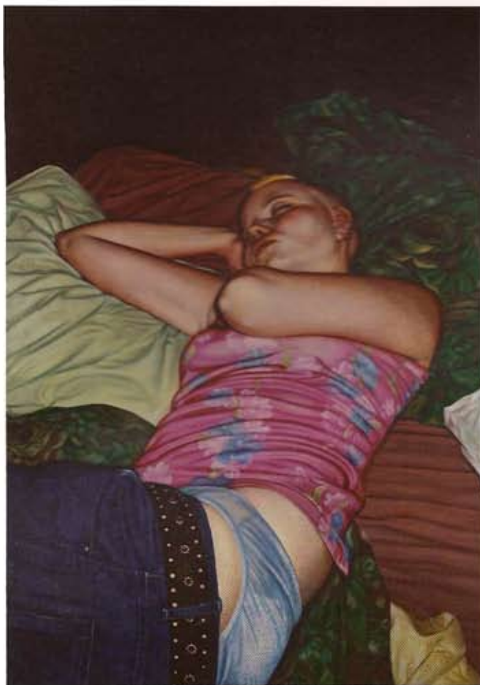
CAMPBELL WALLACE | OPHELIA | OIL ON CANVAS | 48"X32" | 2009