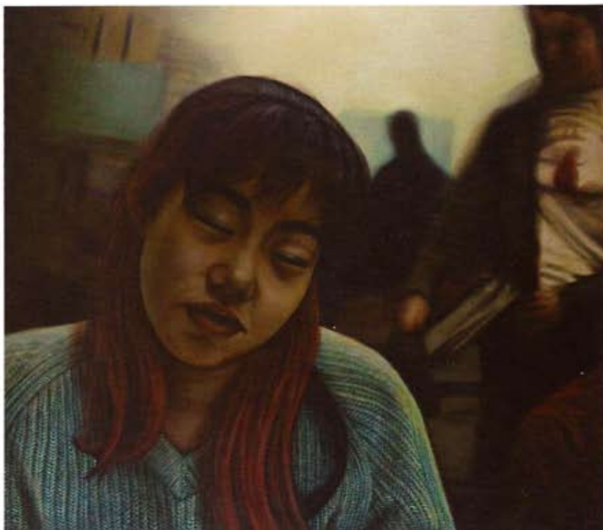
CAMPBELL WALLACE | THE CURSE | OIL ON CANVAS | 42"X48" | 2007