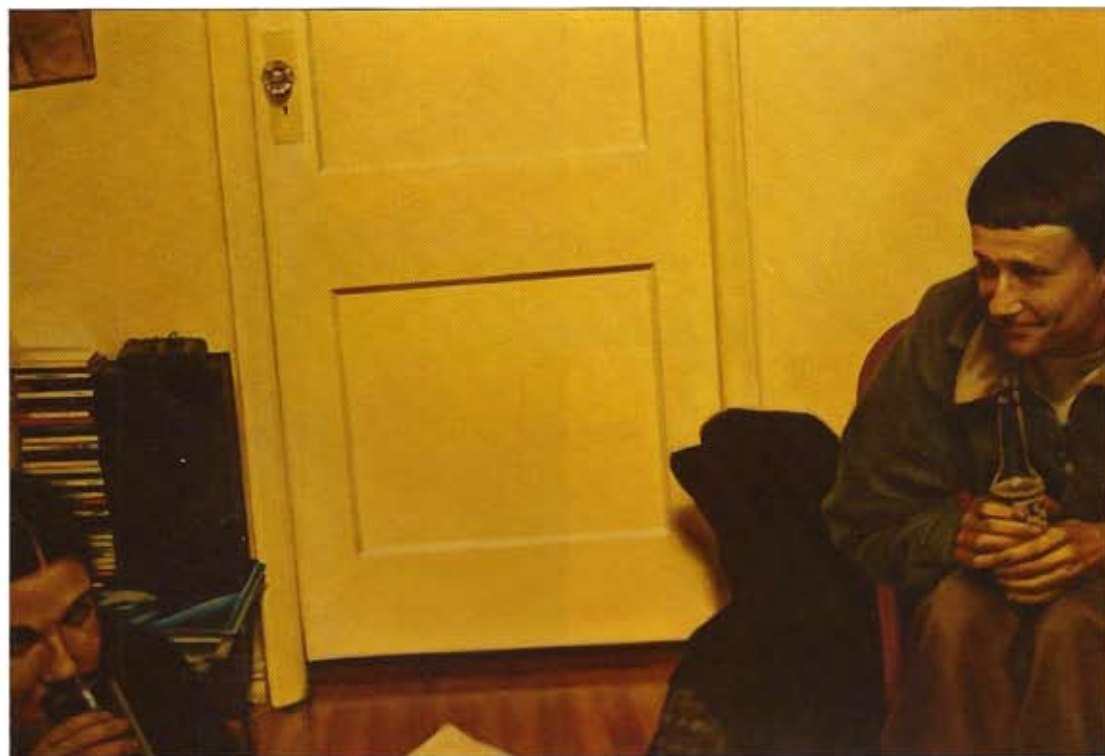
CAMPBELL WALLACE | A DOOR | OIL ON CANVAS | 40"X60" | 2005