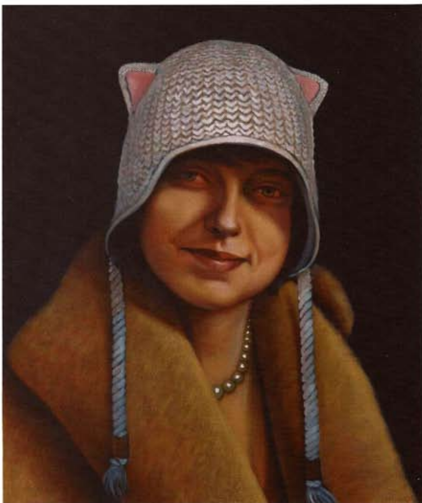
CAMPBELL WALLACE | THE ALBERTAN | OIL ON CANVAS | 22"X26" | 2009