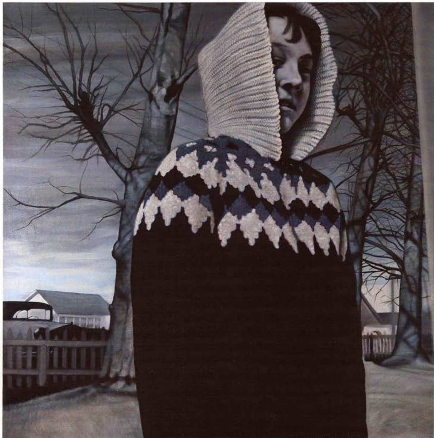
CAMPBELL WALLACE | THE TEMPEST | OIL ON CANVAS | 36"X36" | 2008